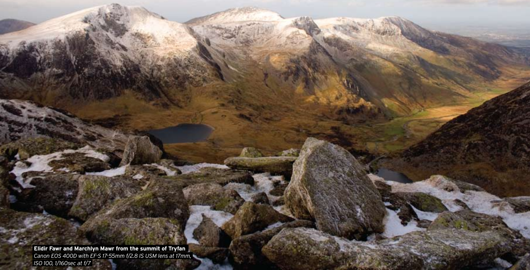
Elidir Fawr and Marchlyn Mawr from the summit of Tryfan Canon EOS 400D with EF-S 17-55mm f/2.8 IS USM lens at 17mm, ISO 100, 1/160sec at f/7