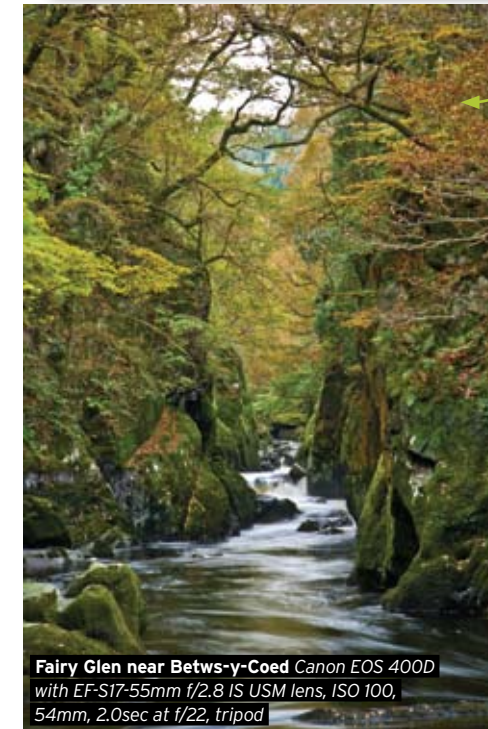
Fairy Glen near Betws-y-Coed Canon EOS 400D with EF-S17-55mm f/2.8 IS USM lens, ISO 100, 54mm, 2.0sec at f/22, tripod

» Caffi Gwynant Café A lovely community run café in a converted chapel, serves delicious food made from local Welsh produce. Look out for the local Snowdonia Ale and postcards by other local photographers. www.cafesnowdon.co.uk